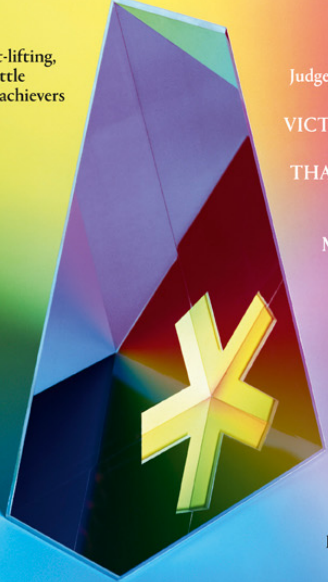
Who's a WAWA* winner? Our 2014 trophy, designed for us by Nendo

Eye-popping, spirit-lifting, gold star-worthy little wonders and high achievers